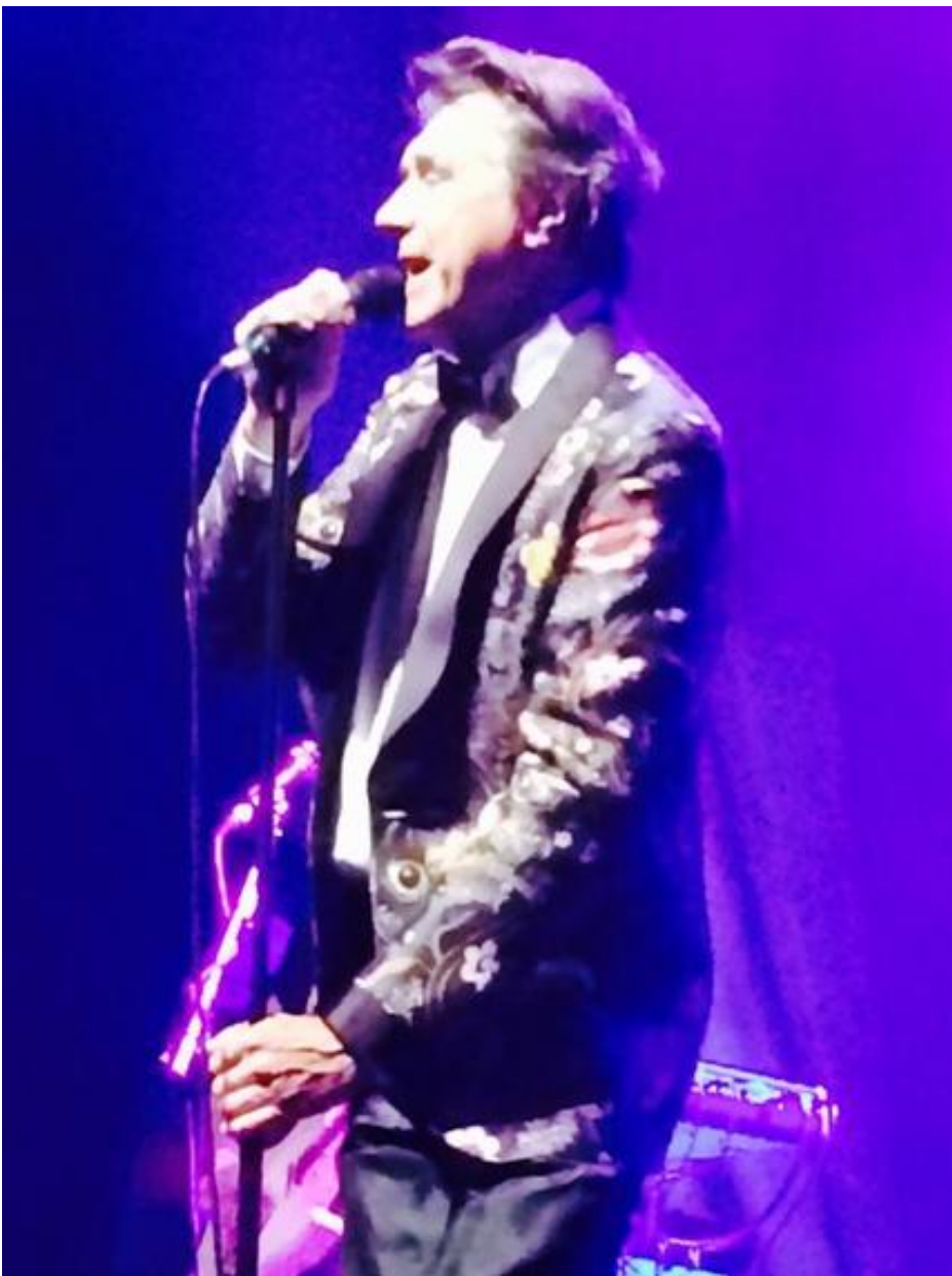
Bryan Ferry, 4/10/14, Tower Theater, Philadelphia.

His voice improved as the nearly 90-minute set went on, about half of which he retired to the keyboards sitting on the raised platform to the right of the drummer, when he wasn't centre stage holding court.